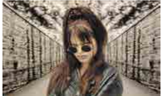
2000 - 'Streetwise' by Simon Allen MPAGB EFIAP of Dumfries Camera Club.