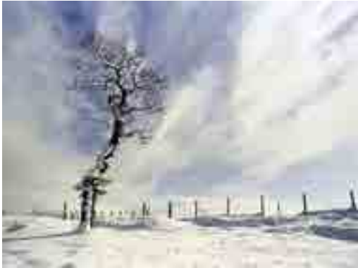
'Tree in Winter' by Rod Wheelans MPAGB EFIAP ARPS of Dumfries Camera Club.