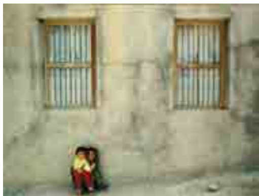
'Under The Windows' by Clive D Turner EFIAP ARPS DPAGB of Paisley Photographic Society.