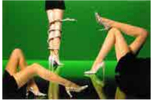
2001 'Irresissstible' by Alastair Swan of Ayr Photographic Society.