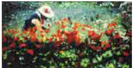
'Poppy Picker' by Al Buntin ARPS of Dundee Photographic Society.