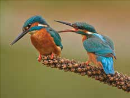
Graham Hilton LRPS BPE2 "Kingfishers - Male & Female"