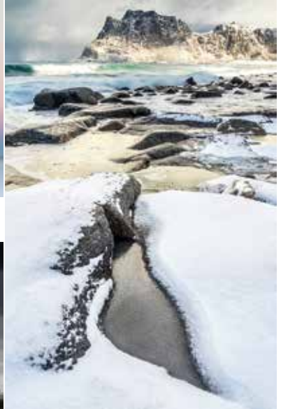
Veronica Barrett FRPS CPAGB Guildford PS "Passing Storm Lofoten Islands"