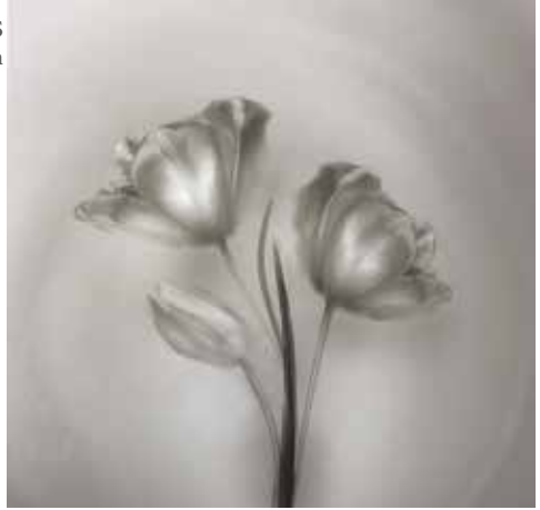
Chorley PS Ribbon