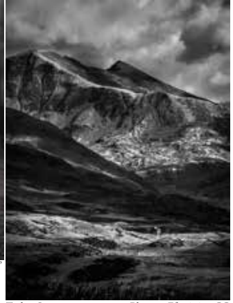
Tudur Owen Blaenau Ffestiniog CC "E Ty Yn Y Mynydd"