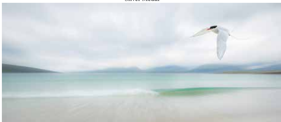
"Arctic Tern over Luskentyre"