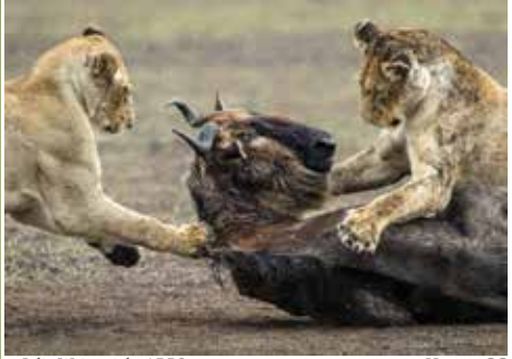
Julia Wainwright ARPS Harrow CC "Wilderbeast Facing Certain Death"