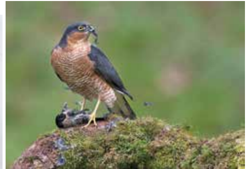
Ken Wilkie Eastwood PS "Sparrowhawk With Prey"