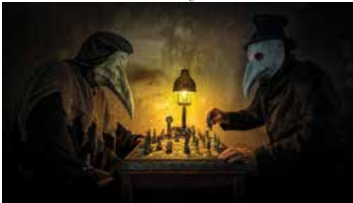
Dan Beecroft CPAGB BPE2 Loughton CC "It's All on the Line"