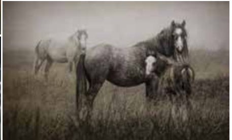
Calvin Downes EFIAP "Keeping an Eye" Wrekin Arts PC