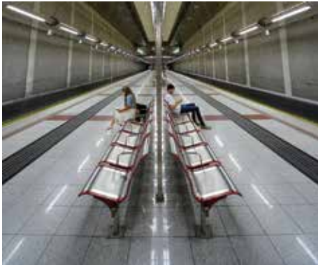
Vassilis Korkas Aldershot CC "Strangers in the Night"