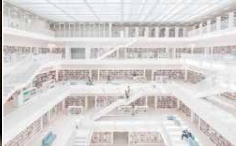
Les Forrester BA(Hons) DPAGB AFIAP BPE3 "The Municipal Library"