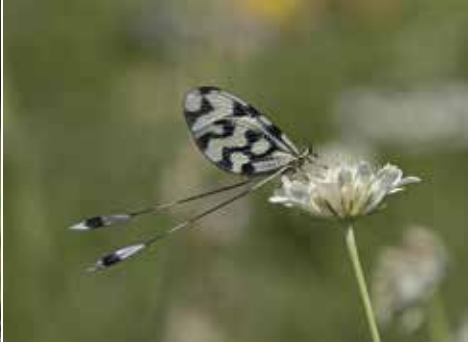
Ralph Snook ARPS DPAGB EFIAP "Nemoptera Sinuata" NW Bristol CC