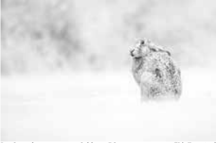
Ian Snowdon Saltburn PS "It's Freezing"