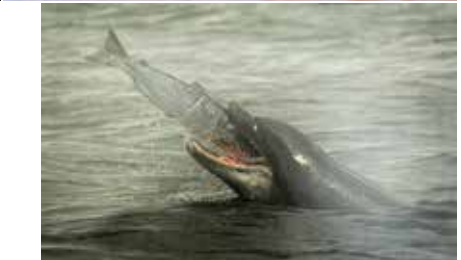
Keith Polwin ARPS Basingstoke CC "Bottlenose Dolphin with Salmon"