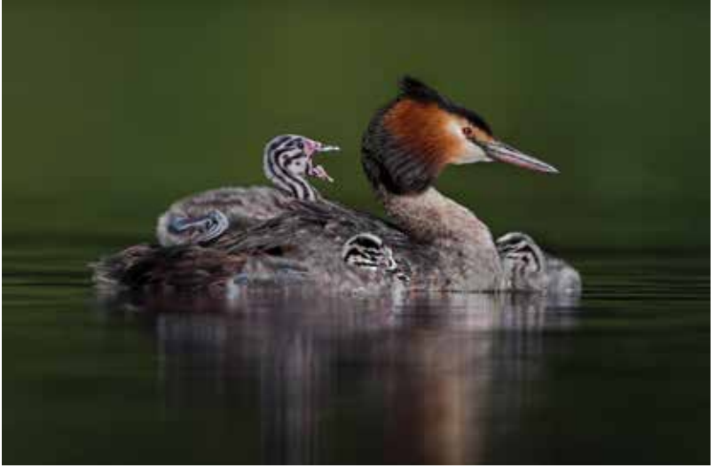
Damian Black Wigan 10 Photo Club "A Great Crested Grebe with Chicks" Ribbon