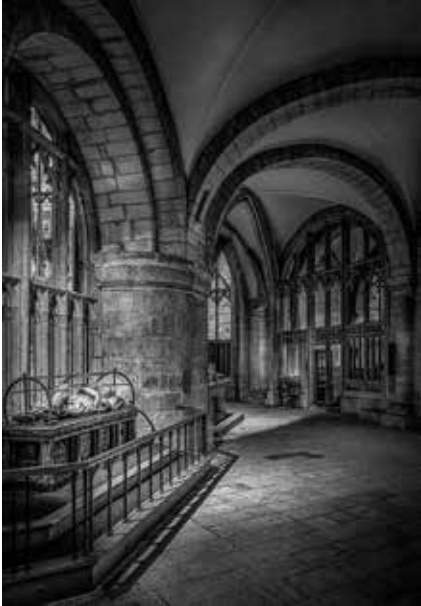
Clive Tanner FRPS MPAGB Maidstone CC "Gloucester Cathedral"