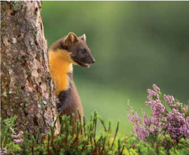
Phil Morgan Inn Focus Group "Pine Marten Martes Martes" Ribbon