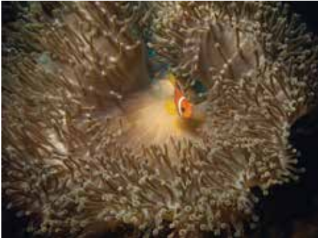
Gill O'Meara Poulton le Fylde PS "Anemone with Clown Fish"