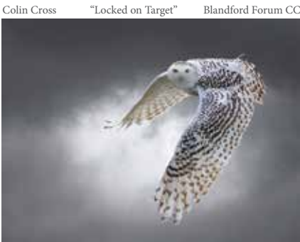
Colin Cross "Locked on Target" Blandford Forum CC