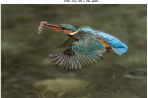
Allan Willis Overton PC "In Flight"