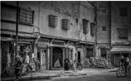
Lawrence Homewood East Grinstead CC "Life in Old Marrakech"