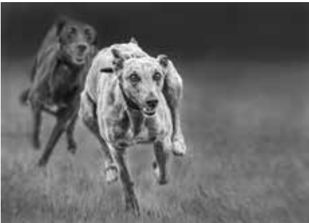
Kirsty Cussens Rolls Royce Derby PS "Lurcher Coursing"