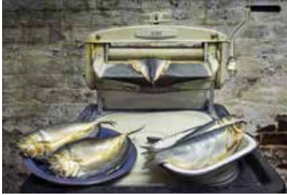
Roy Essery MPAGB Colchester PS "Kipper Production Line"