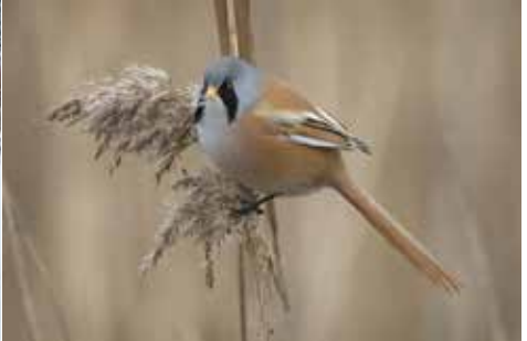
Brian Sweeting "Reed Bunting on Reed" Bridgwater PS