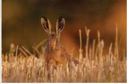
Kevin Pigney LRPS Ely PC "Harvest Hare"