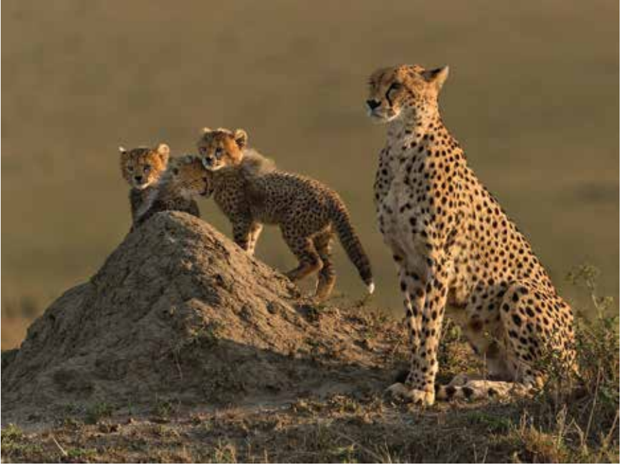
Ian Whiston DPAGB