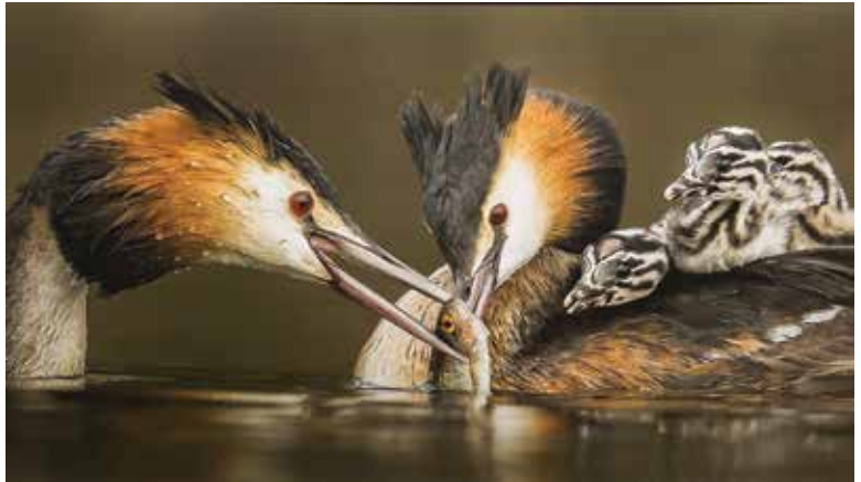
Les Beardmore CPAGB BPE3 Blythe Bridge CC "Great Crested Grebe Feeding Young" Ribbon