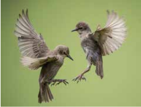
Phil Barber MPAGB BPE5 Wigan 10 Foto Club "Juvenile Starling Dispute"