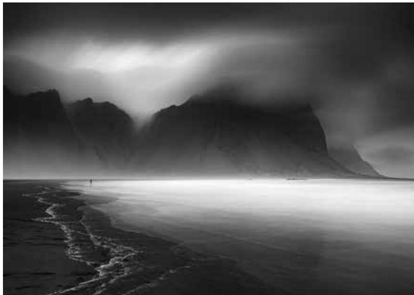
Wolds PS Ribbon