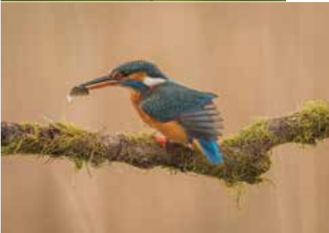
Phil Drury Ashford PS "Female Kingfisher with a Speared Fish"