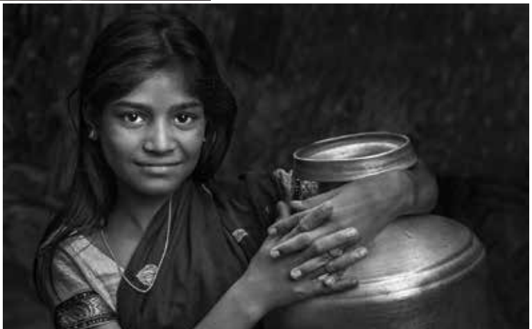
Beyond Group Ribbon