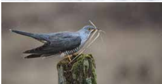
Gavin Forrest DPAGB AFIAP "Cuckoo With Mating Offering" Carluke CC