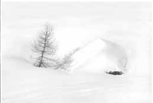
Tom Dodd FRPS DPAGB FIFP Eryri PG "Tree Snowdrift"