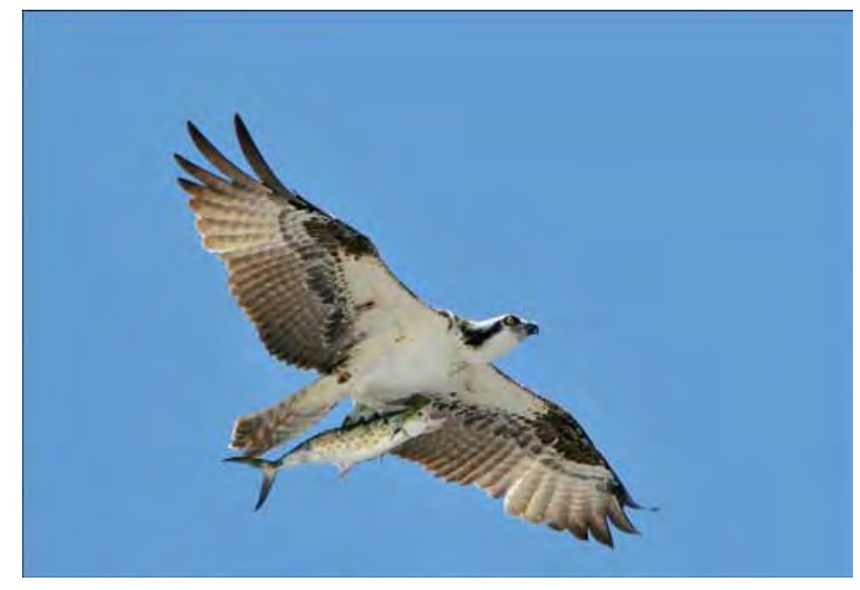
Osprey and Fish