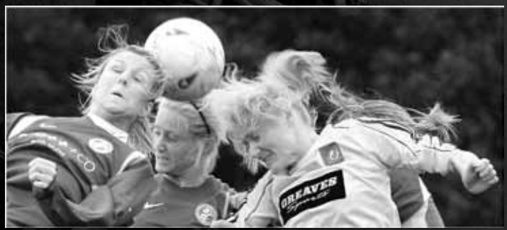
Girl Headers by Campbell Skinner DPAGB BPE2* Greenock CC