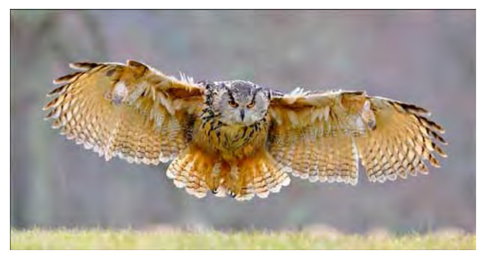
European Eagle Owl