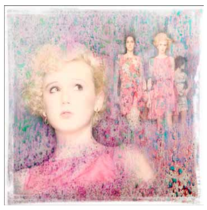
Blonde by Rikki O'Neill FRPS MPAGB FIPF Dundee PS