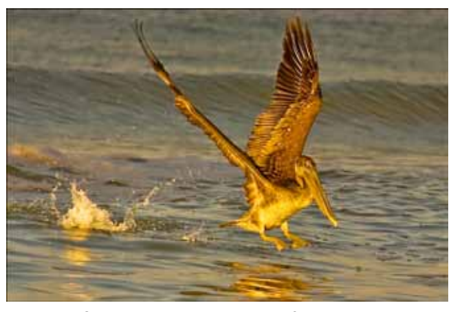
Pelican Take Off