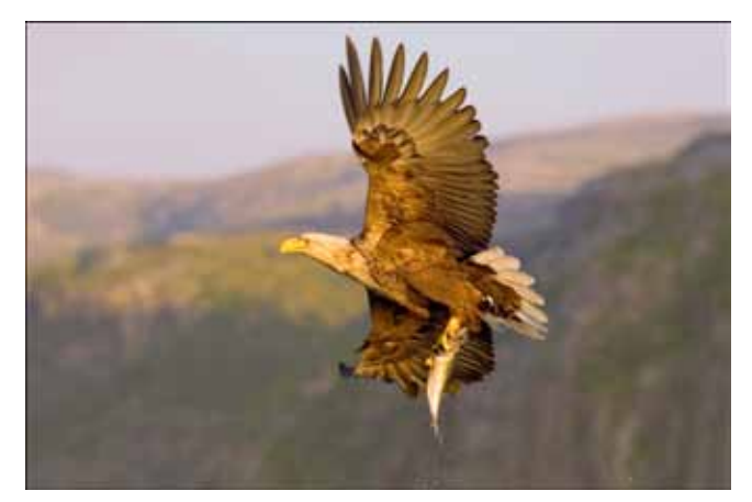
White Tailed Sea Eagle by Edmund Fellowes MPAGB Dumfries CC