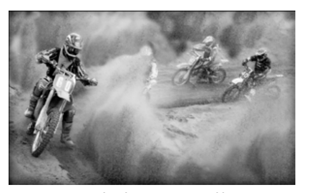
Motocross Racers by Gray Garner MBE Moray CC