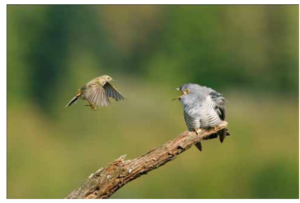
Cuckoo and Meadow pipit by Edmund Fellowes MPAGB (Special Award - Best Bird Image) Dumfries CC