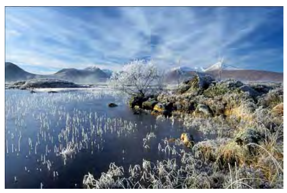
Frosty Rannoch (Gold Medal) Edinburgh PS