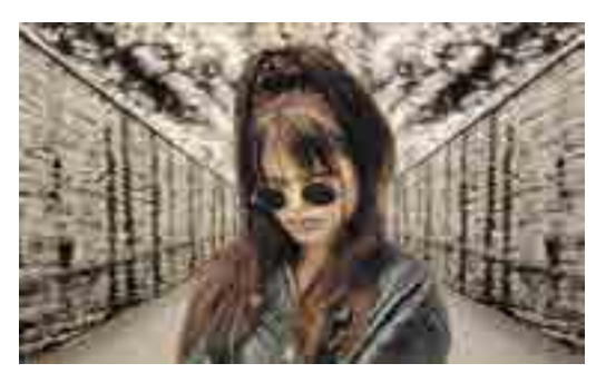
2000 - 'Streetwise ' by Simon Allen MPAGB EFIAP of Dumfries Camera Club.