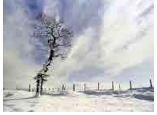
'Tree in Winter' by Rod Wheelans MPAGB EFIAP ARPS of Dumfries Camera Club.