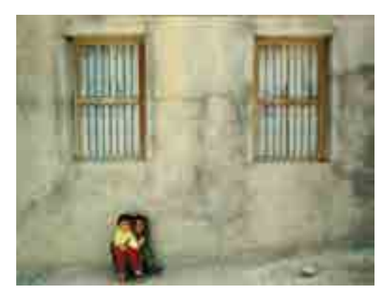
'Under The Windows' by Clive D Turner EFIAP ARPS DPAGB of Paisley Photographic Society.