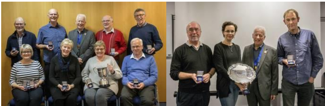
Above – 2019 Digital Championship presentations for the Finalists (L) and the three tied Plate Trophy Winners (R). Visit the below weblink for all of Plate Trophy Winner's Images -

https://www.scottish-photographic-federation.org/spf-digital-championship-2019-plate-trophy-winners