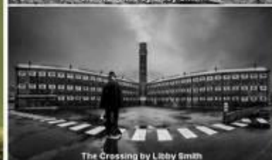
The Crossing by Libby Smith