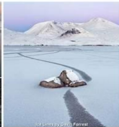
Ice lines by Gavin Forrest