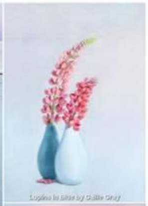
Lupine in Blue by Gail Gray