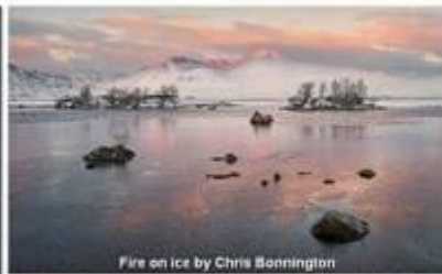
Fire on ice by Chris Bonnington