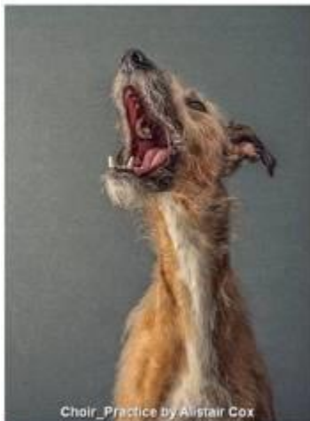
Choir_Practice