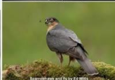
Sparrowhawk and fly