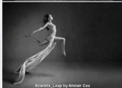
Scarlets_Leap