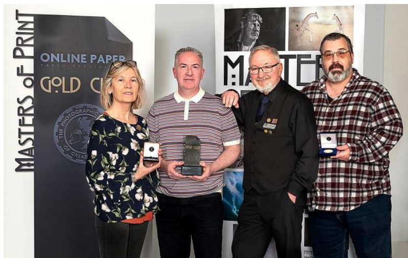
Presentation of the Online Paper Gold Club Trophy and Individual medals to Catchlight CC.

and... Images from all of the successful Scottish FIAP Distinctions 2022