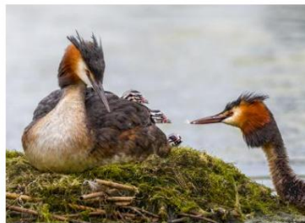
A selection of the 2024 Annual Portfolio Award Winners