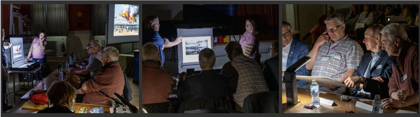
Above – The Saturday Adjudication in progress