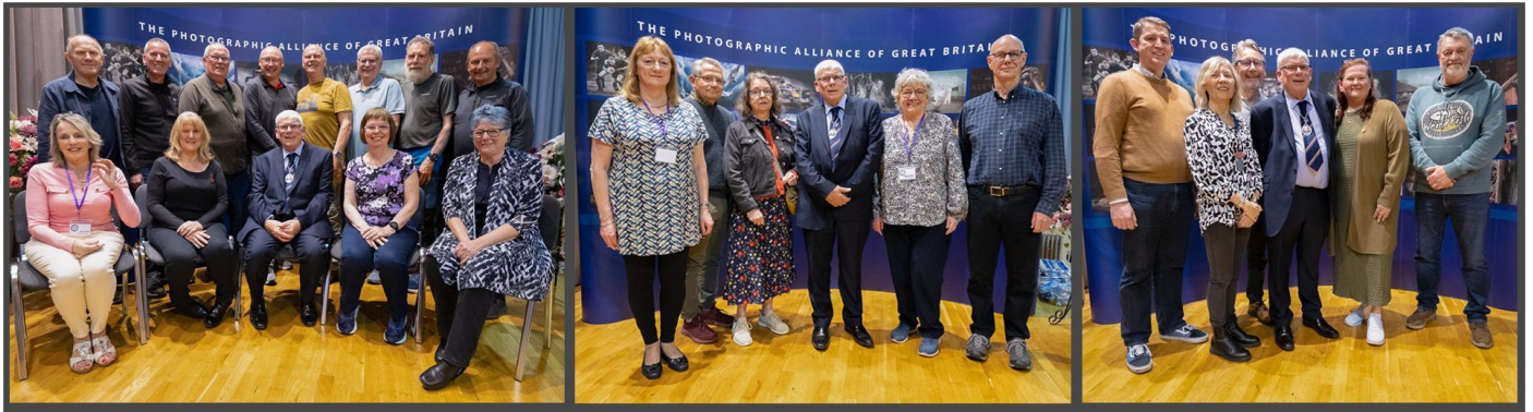
Above - Successful photographers present – Left - DPAGB, Middle - EPAGB and Right - MPAGB