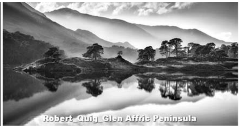
Robert_Quig_Glen Affric Peninsula