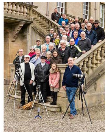
Falkirk Camera Club & friends Callendar House, October 2017

CLICK HERE for e-salon 17 with details on some of this year's Judges and all the information you need to enter The 95th Scottish International Salon of Photography.