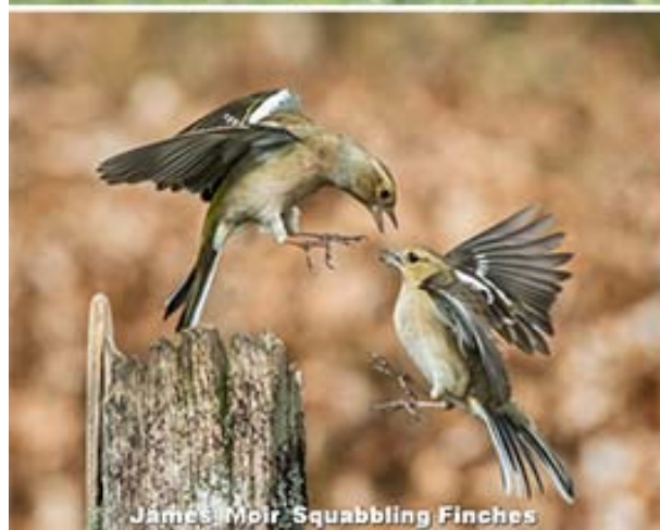
James Moir Squabbling Finches