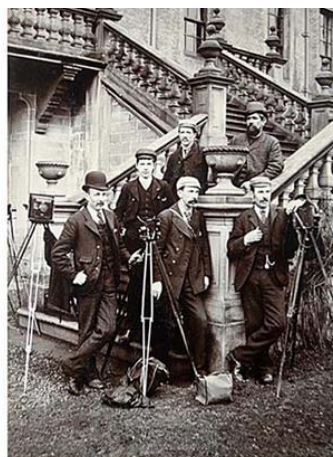
Callendar House, c1890