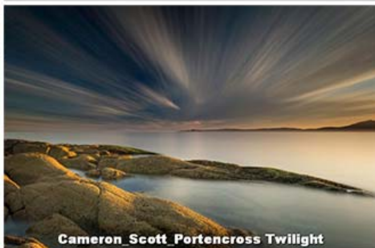
Cameron Scott Portencross Twilight