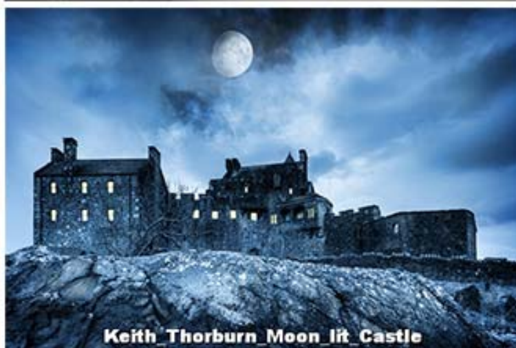
Keith Thorburn Moon lit Castle