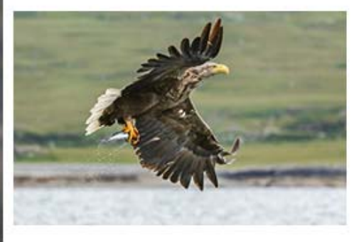
10 | McF Sea Eagle with Catch