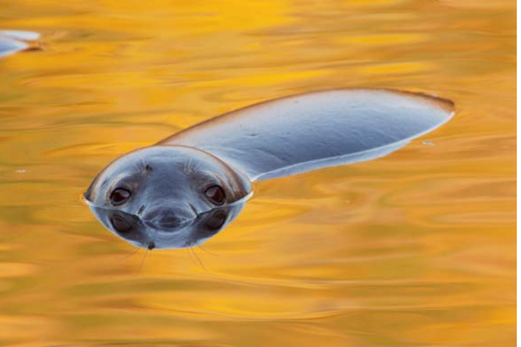
Grey Seal at Dawn by Edmund Fellowes