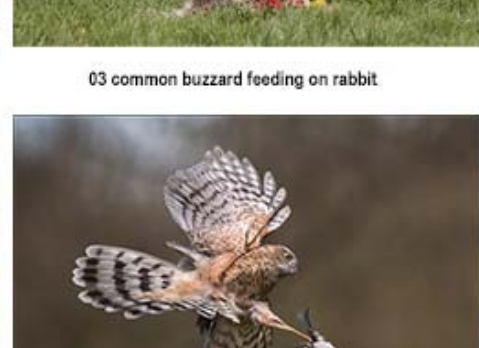
06 MD Predator and Prey