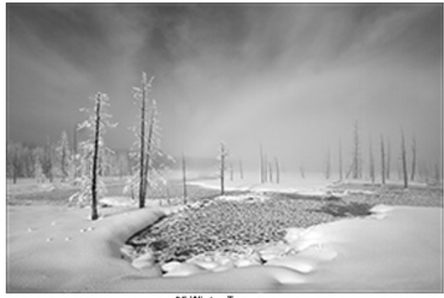
05 Winter Trees