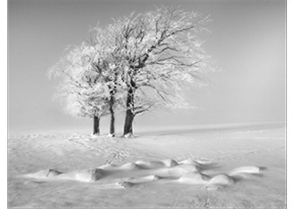
03 Winter Treeline