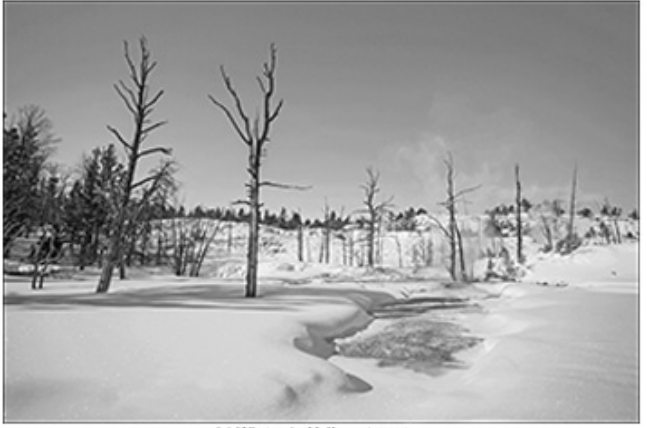
01 Winter in Yellowstone