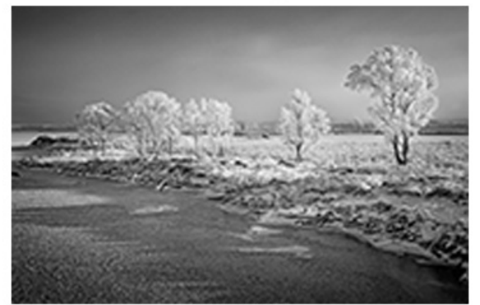
07 Winter Frost