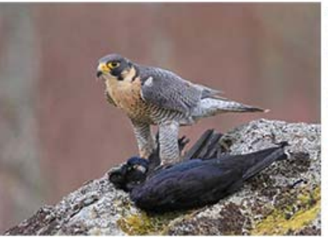
04 AD Peregrine on Prey