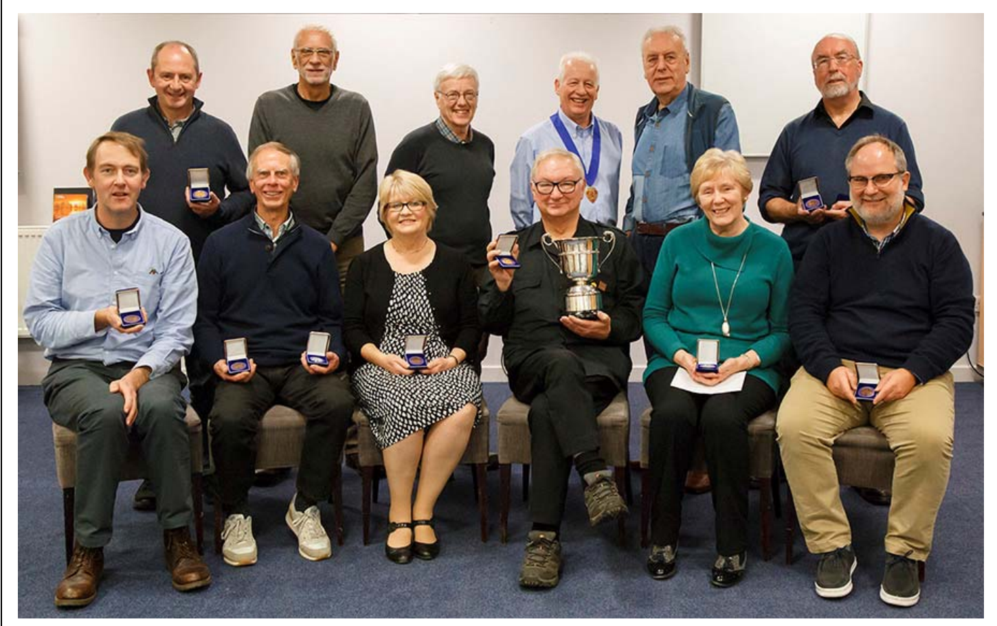
The Club and Individual Award Winners pictured with the judges.

Plate Trophy Winner - SPF Plate Trophy & SPF Silver Medal Strathaven Camera Club