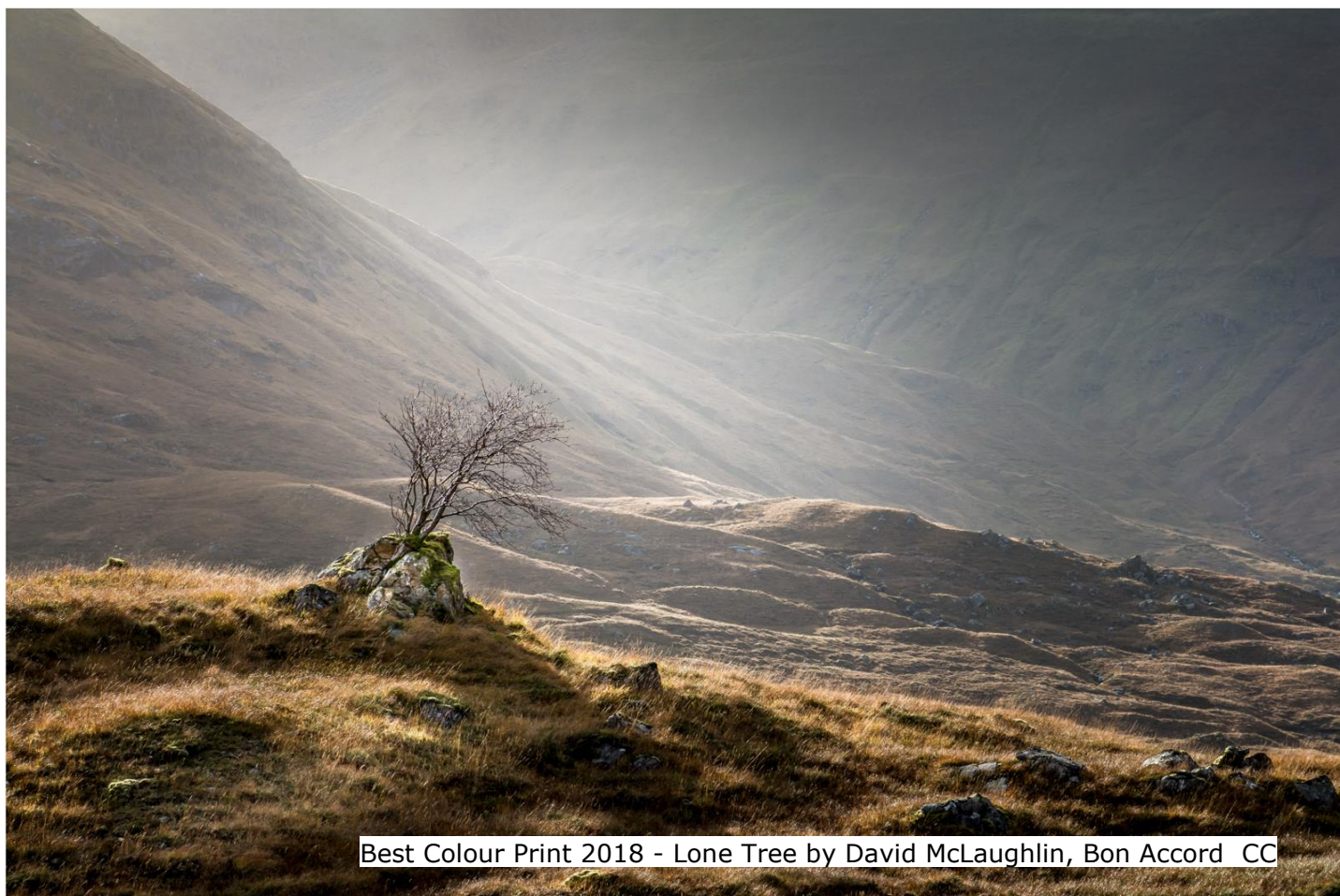
Best Colour Print 2018 - Lone Tree by David McLaughlin, Bon Accord CC

DETAILS OF THE 2019 COMPETITION HAVE BEEN SENT TO ALL CLUB SECRETARIES AND COMPETITION SECRETARIES. IF YOU ARE INTERESTED IN ENTERING PLEASE SEE THEM FOR MORE DETAILS or visit www.scottish-photographic-federation.org/spf-annual-portfolios