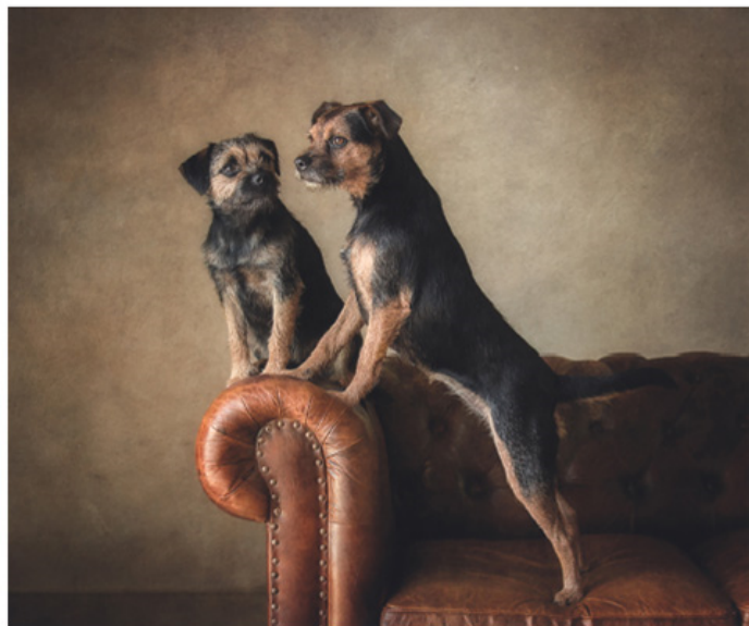
Bonnie & Bella by Barrie Spence

Welcome to one of the most highly regarded international exhibitions in the UK, typically attracting around 3000 entries from all around the world. This salon has been in existence for over 150 years, and during that time has built a strong reputation. We are a print-only exhibition, increasingly rare in these times. Unlike many print exhibitions, we only accept what we can display, thus gaining an acceptance is a high achievement much sought after. All the prints are on display at the Society's premises during the Edinburgh Festivals for 4 weeks in August, maintaining the success of recent years. The Exhibition usually receives over 3000 visitors, many of whom come year after year to view it. All accepted images appear in the catalogue which has had a FIAP 4* rating since 2013.