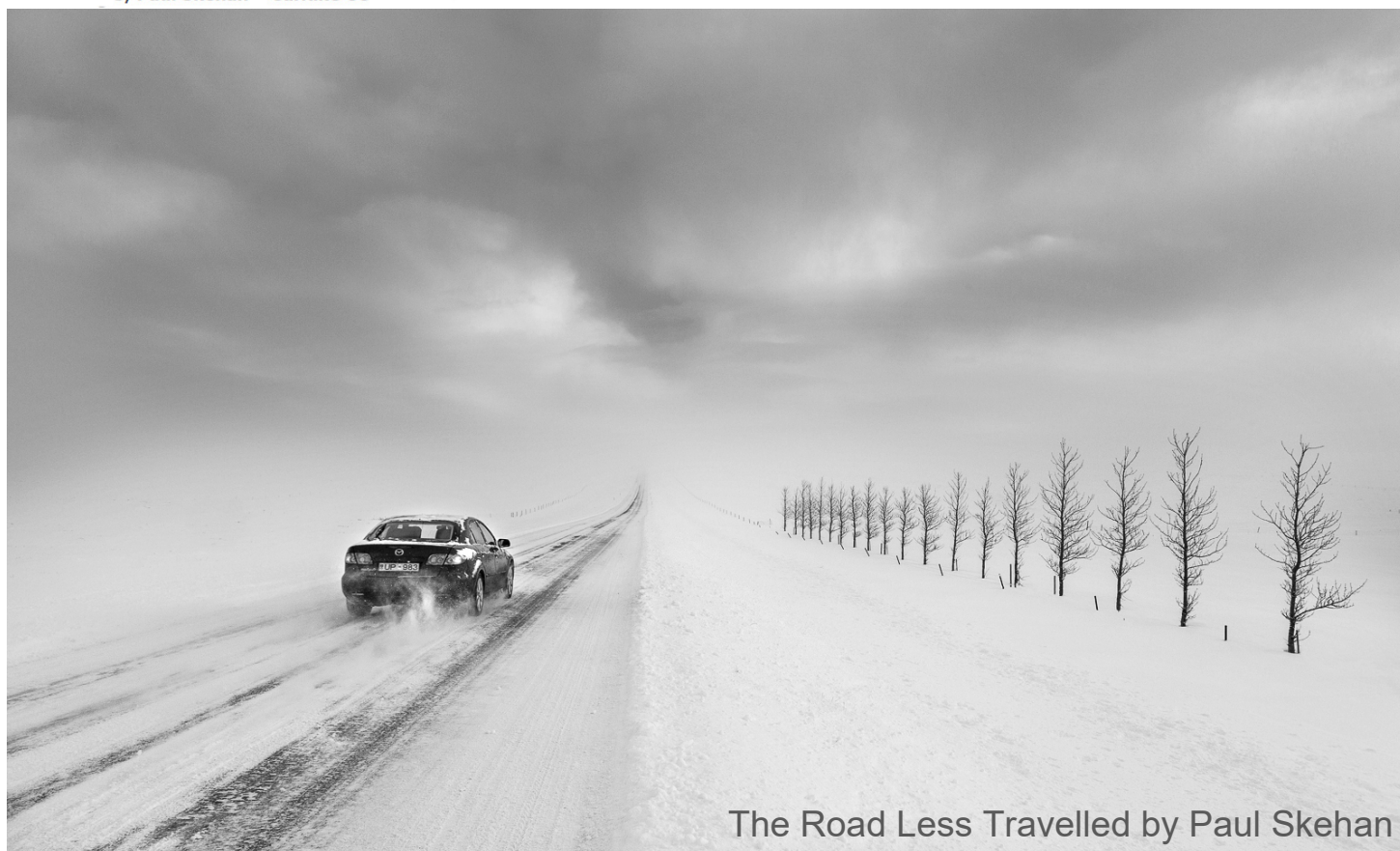
The Road Less Travelled by Paul Skehan

Next page - The remainder of Carluka's final entry of 20 PDI >