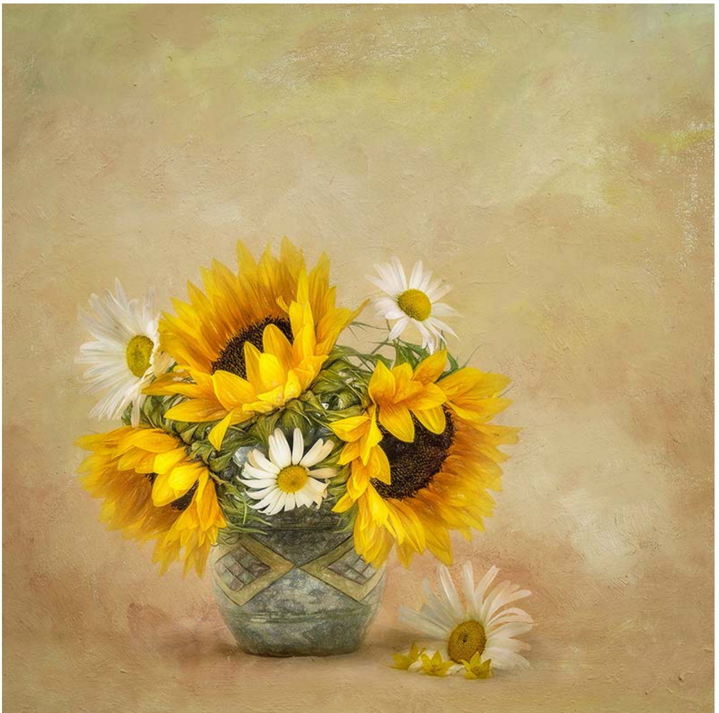
Sunflowers and Daisies by Gaille Gray