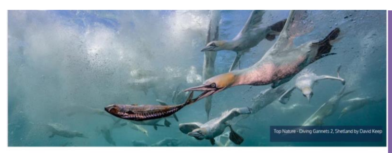
Dingwall National Projected Image Exhibition Awards 2019

The 42nd Dingwall National Projected Image Exhibition 2019 has now been Judged.