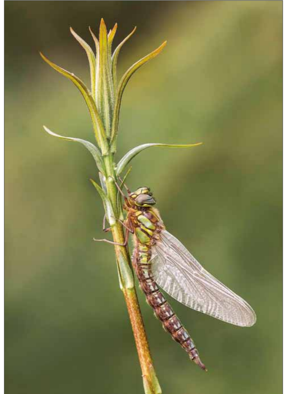
Hairy Dragonfly On Orchid by Lynda Beynon CPAGB AFIAP AWPF