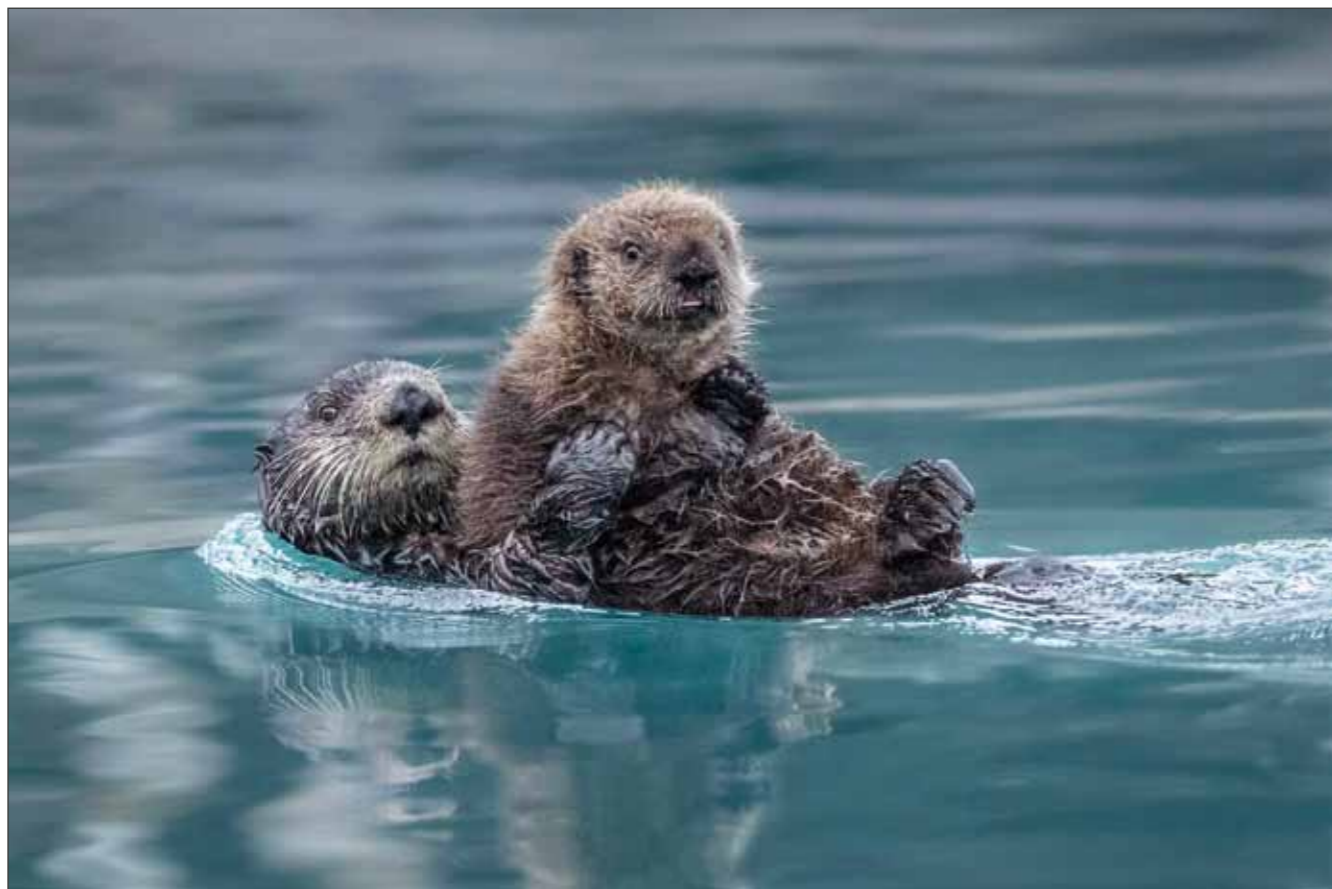
Wary Sea Otter With Young