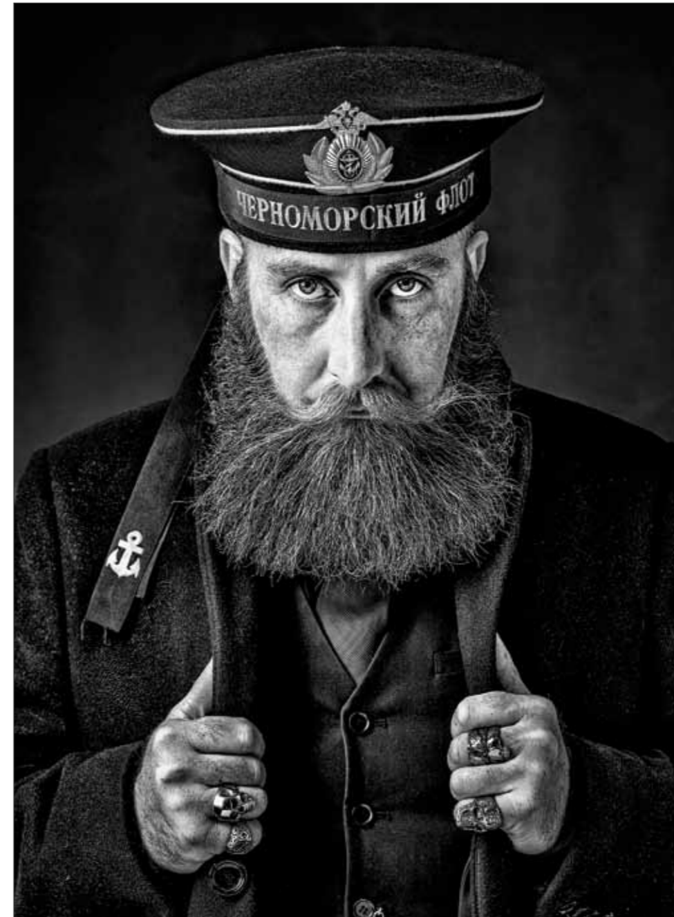
Soviet Sailor