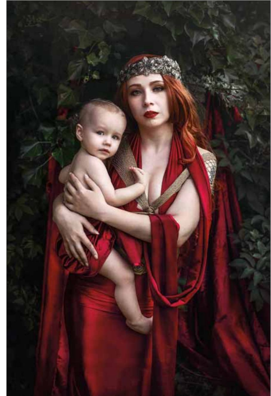
Renaissance Madonna