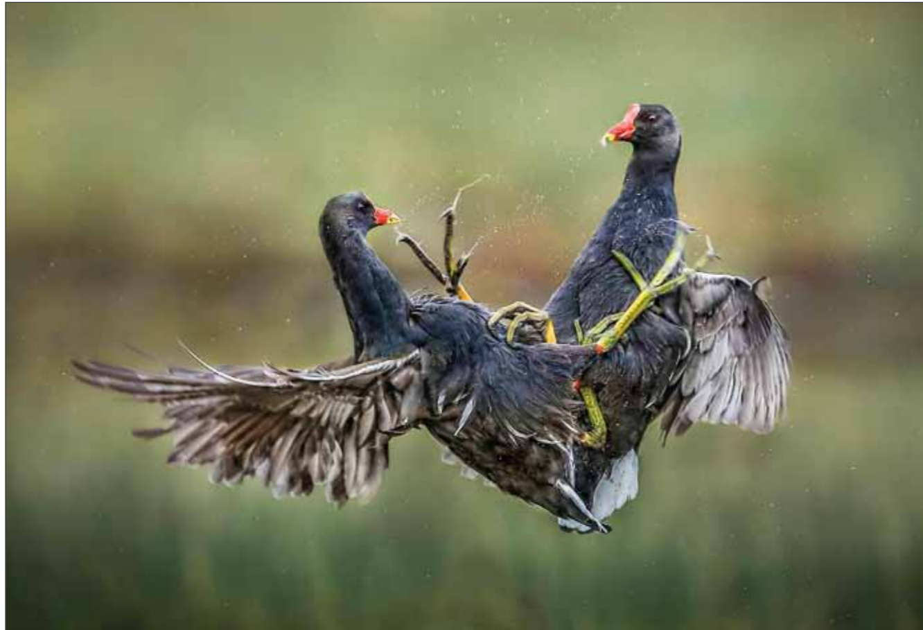
Moorhens In Aerial Combat