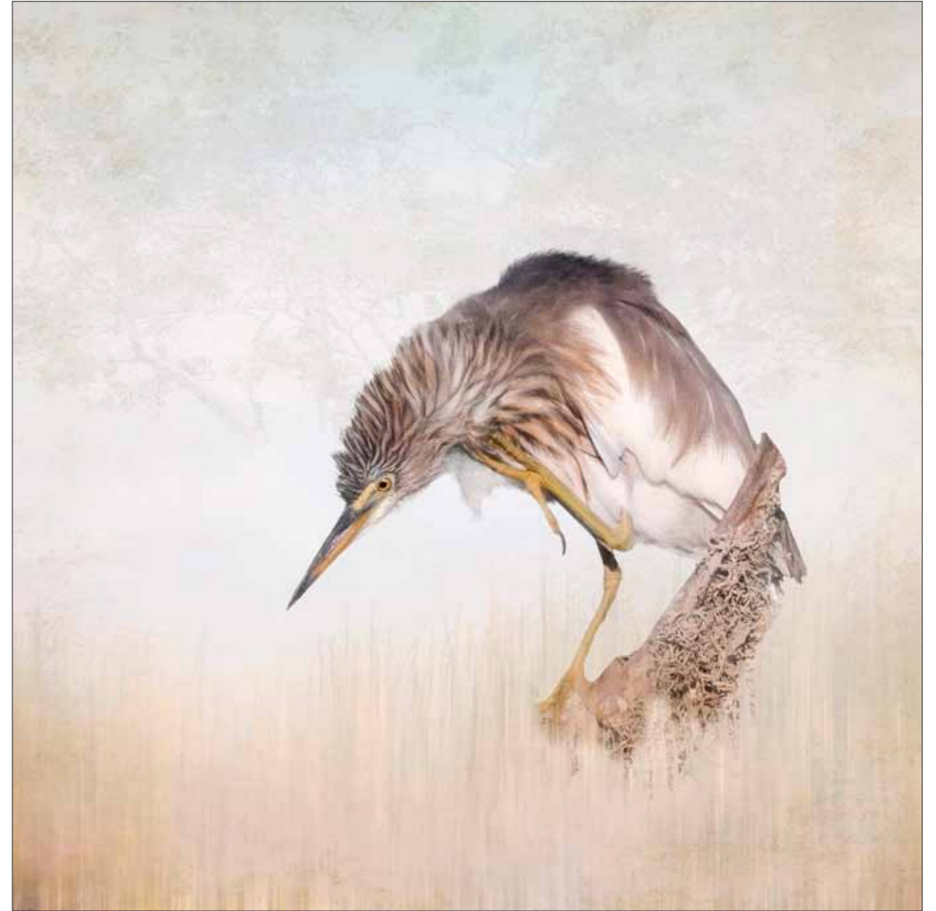
The Itch by Wendy Stowell CPAGB - PAGB Silver Medal