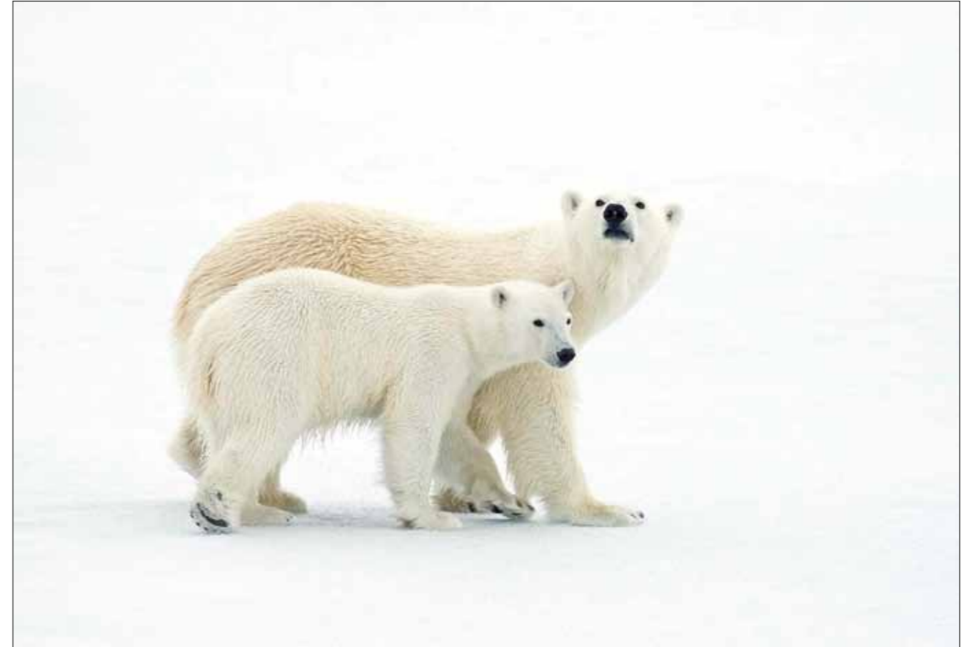
Protection by Keith Snell EFIAP EPSA LRPS