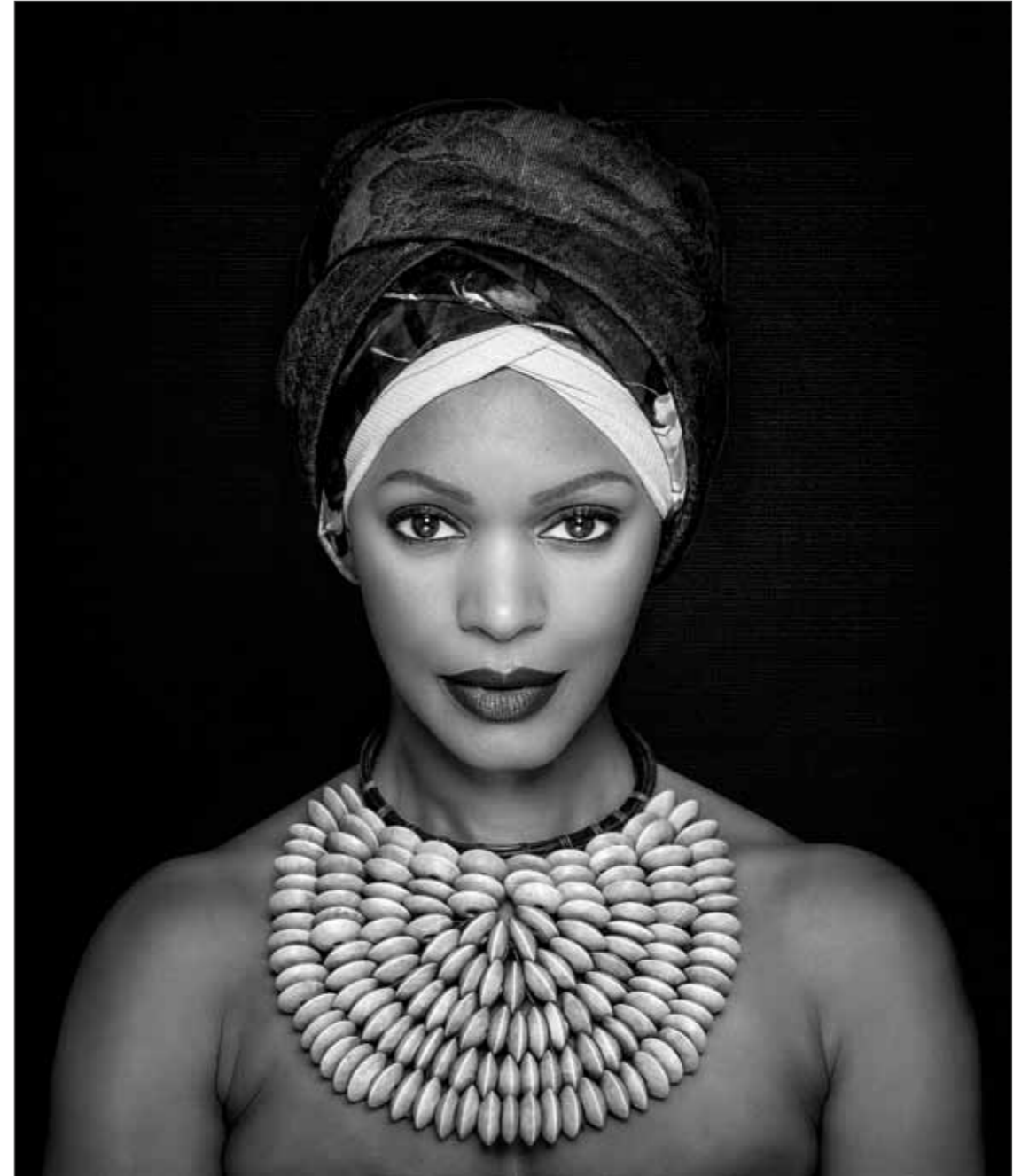
African Beauty by Kean Brown ARPS ABPE