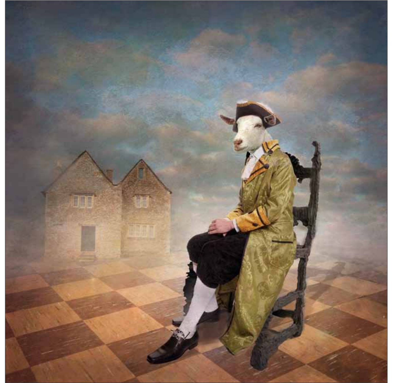
Acting The Goat by Wendy Irwin ARPS