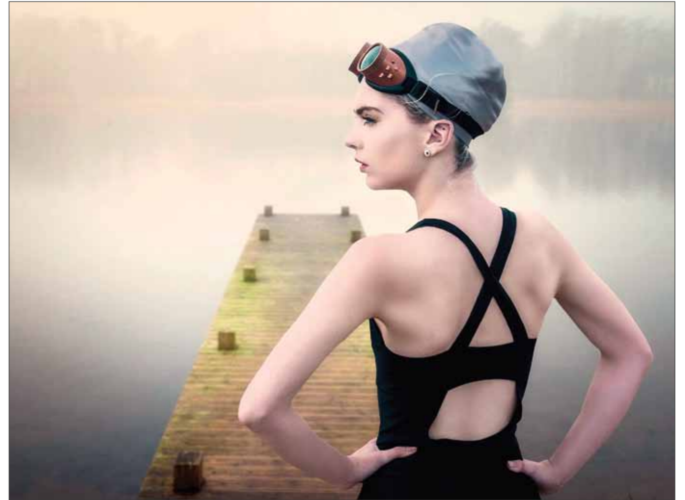
Open Water Swimmer by Gwynfryn Jones DPAGB EFIAP