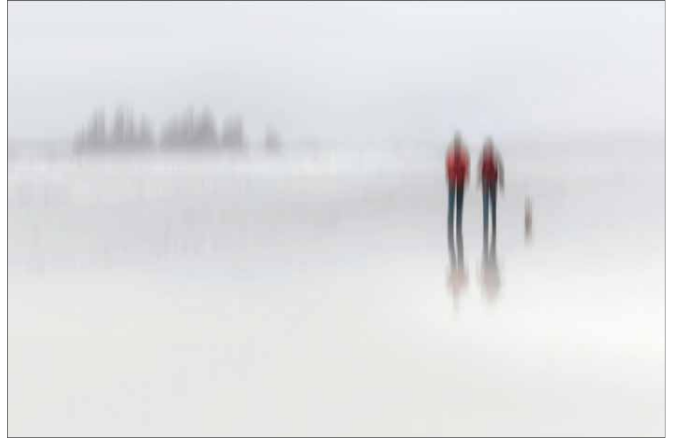
A Walk In The Rain