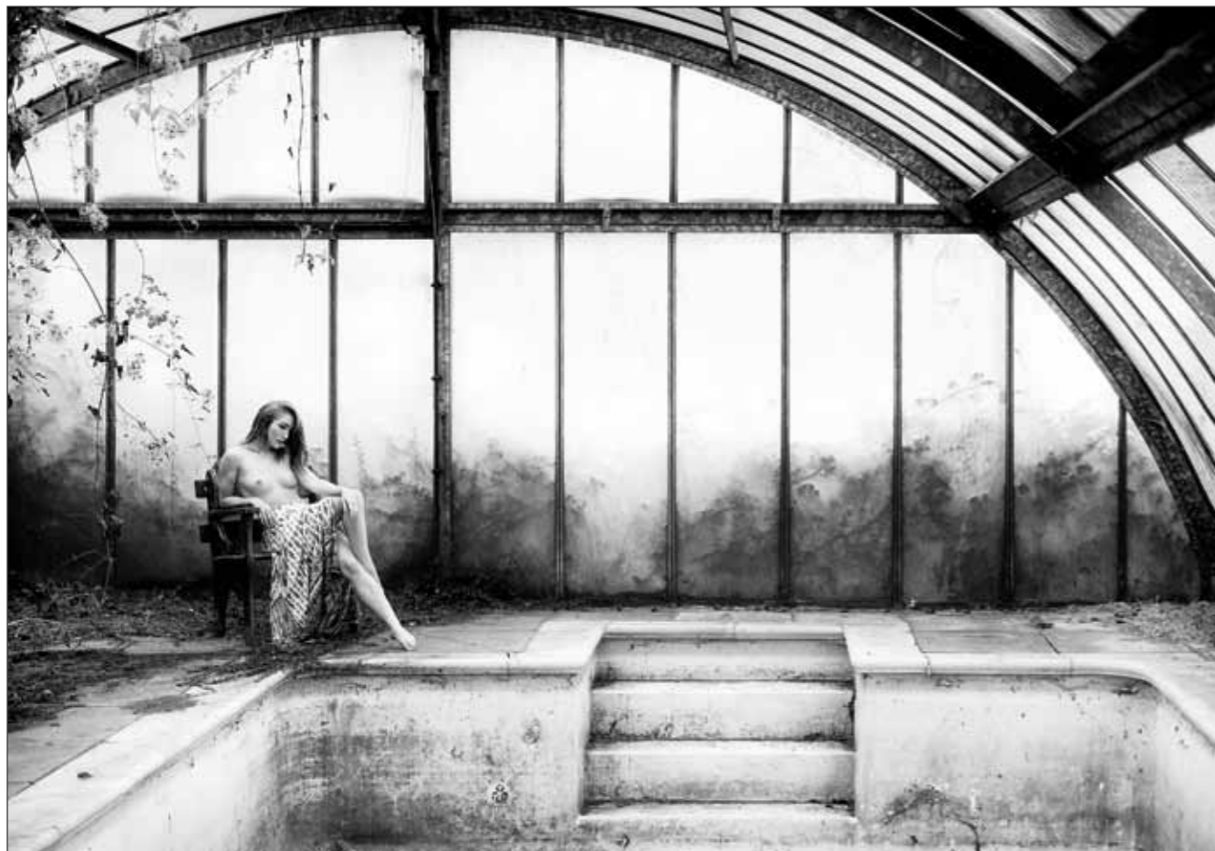
The Old Pool by Simon Raynor CPAGB