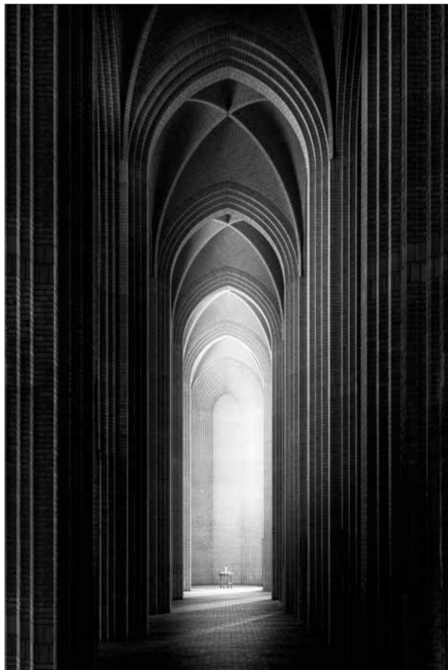
Grundtvigs Church