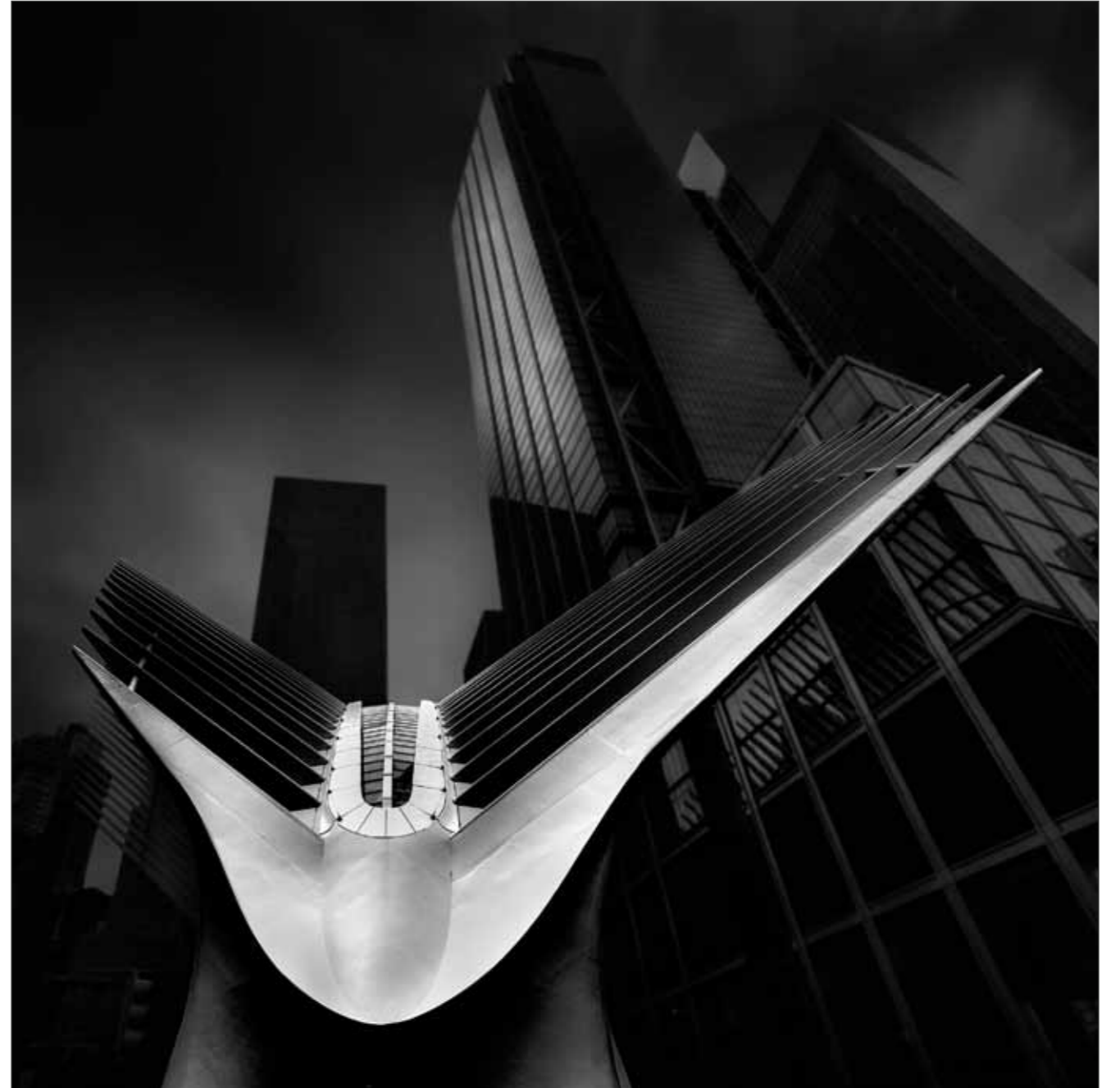
The Oculus by Tillman Kleinhans DPAGB ARPS EFIAP/s BPE4