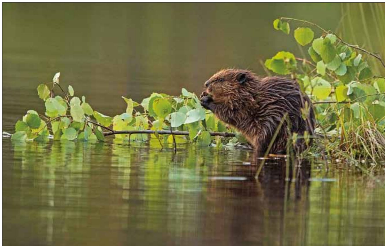
Beaver Kitten Feeding on Aspen