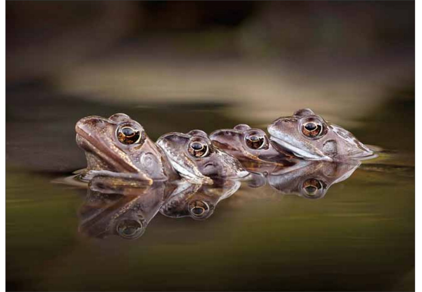
Common Frog Mating Pairs