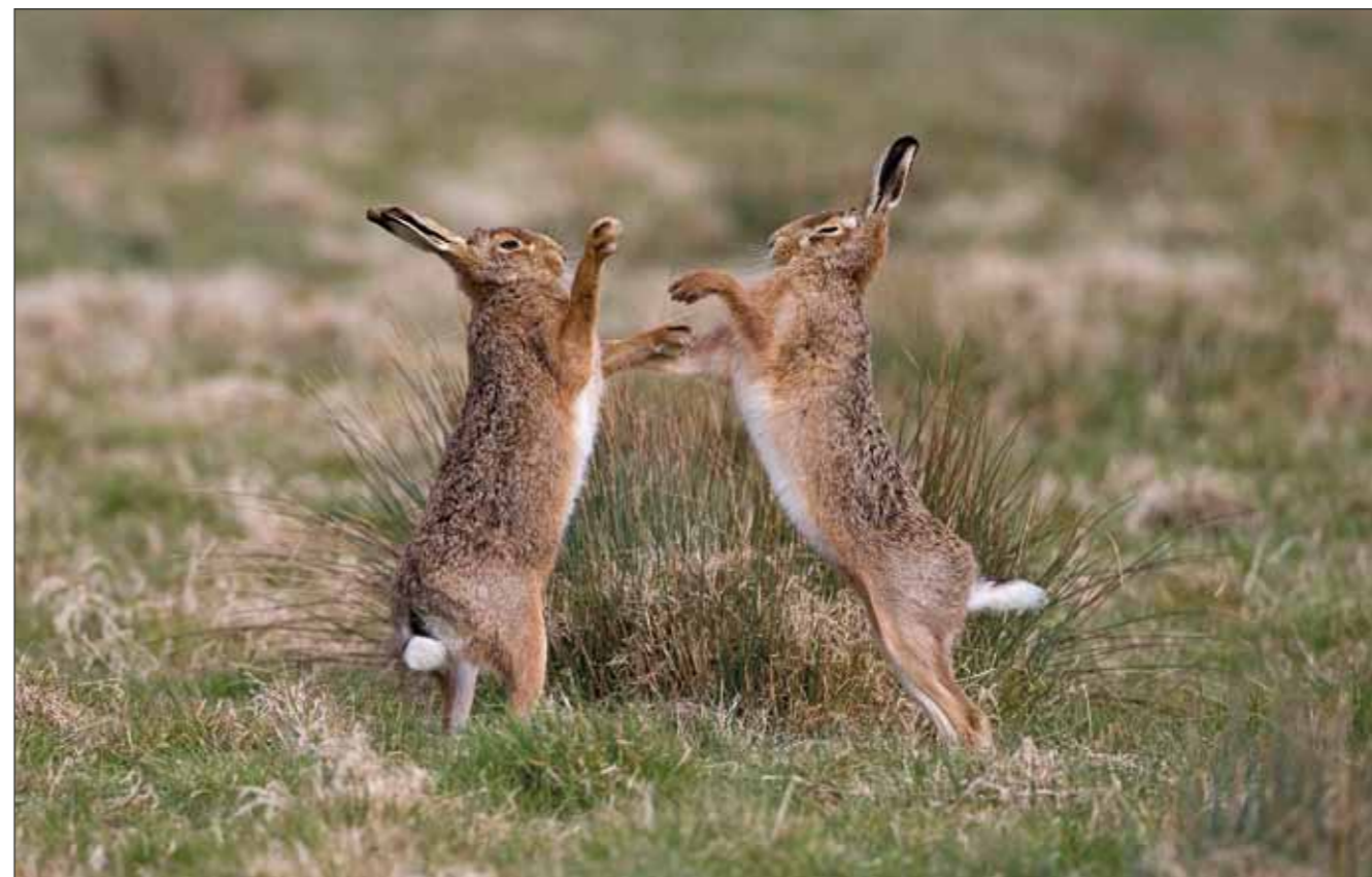
Hares Sparring