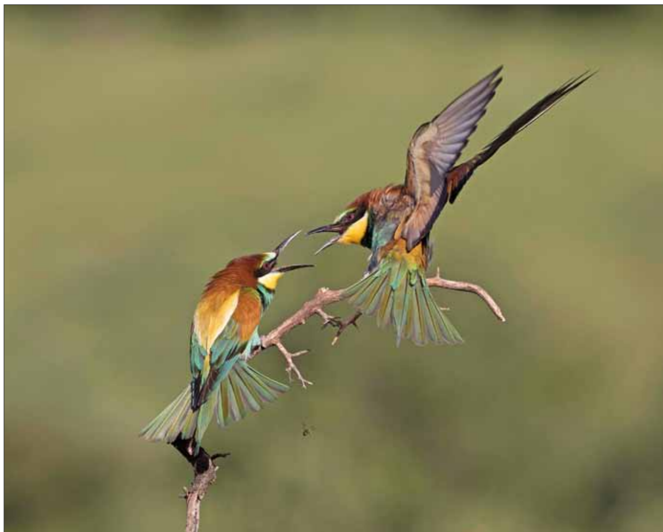
Bee Eater Dispute by Ralph Snook ARPS EFIAP