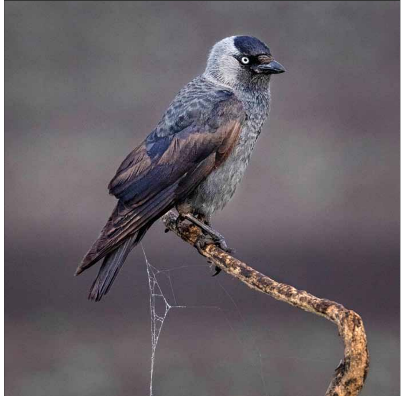
Jackdaw With Web