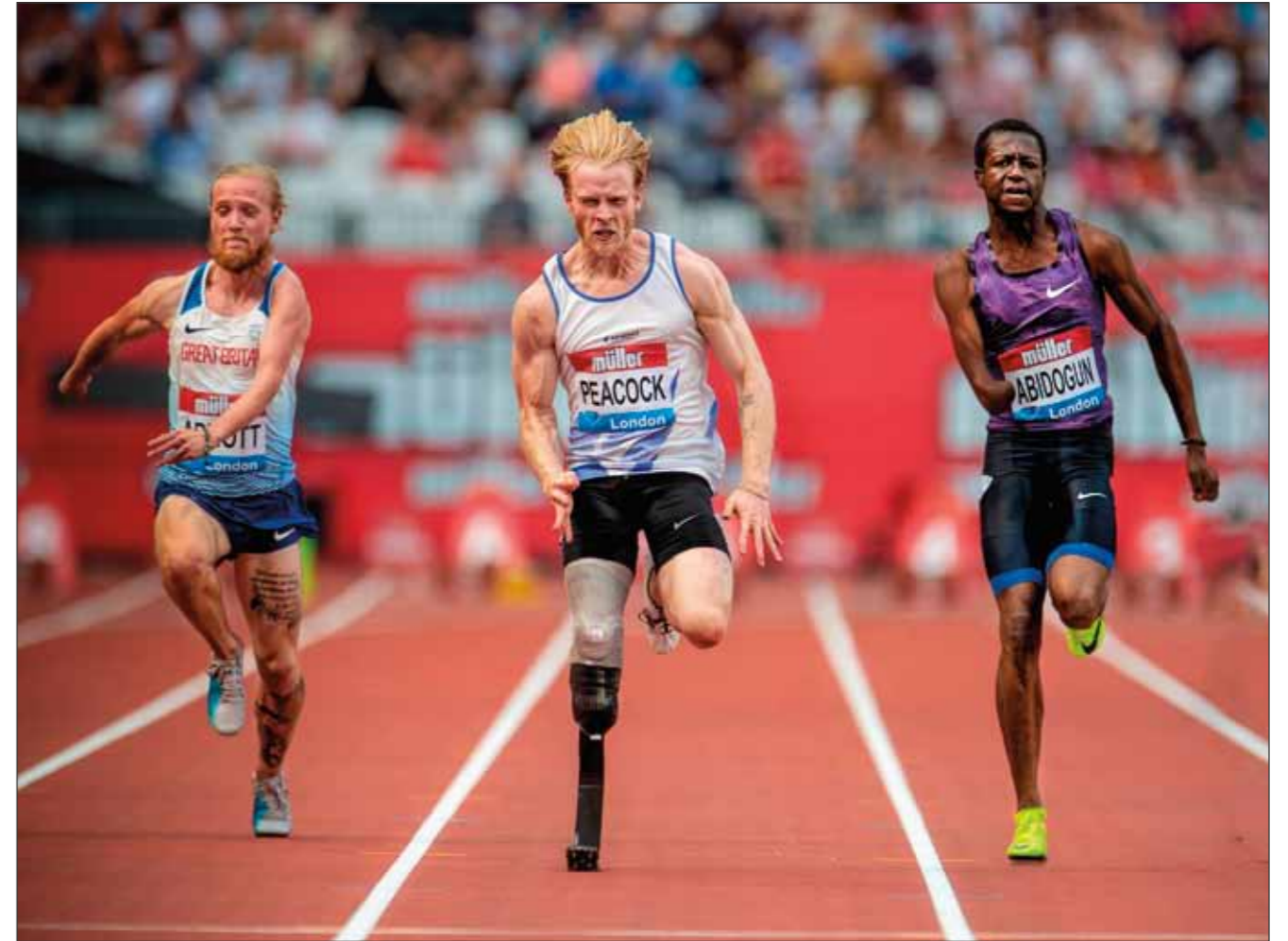
Full Thrust by Warren Alani DPAGB ARPS AFIAP