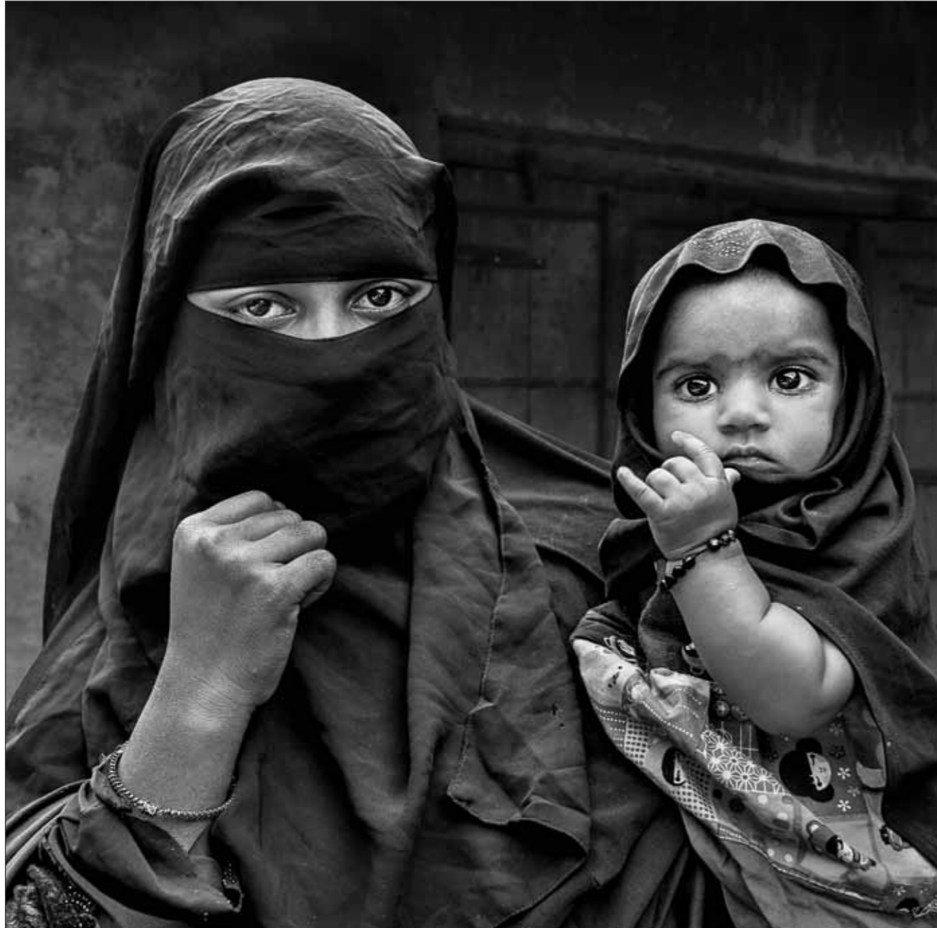
Mothers Eyes by Ian Hammond DPAGB LRPS - PAGB Silver Medal