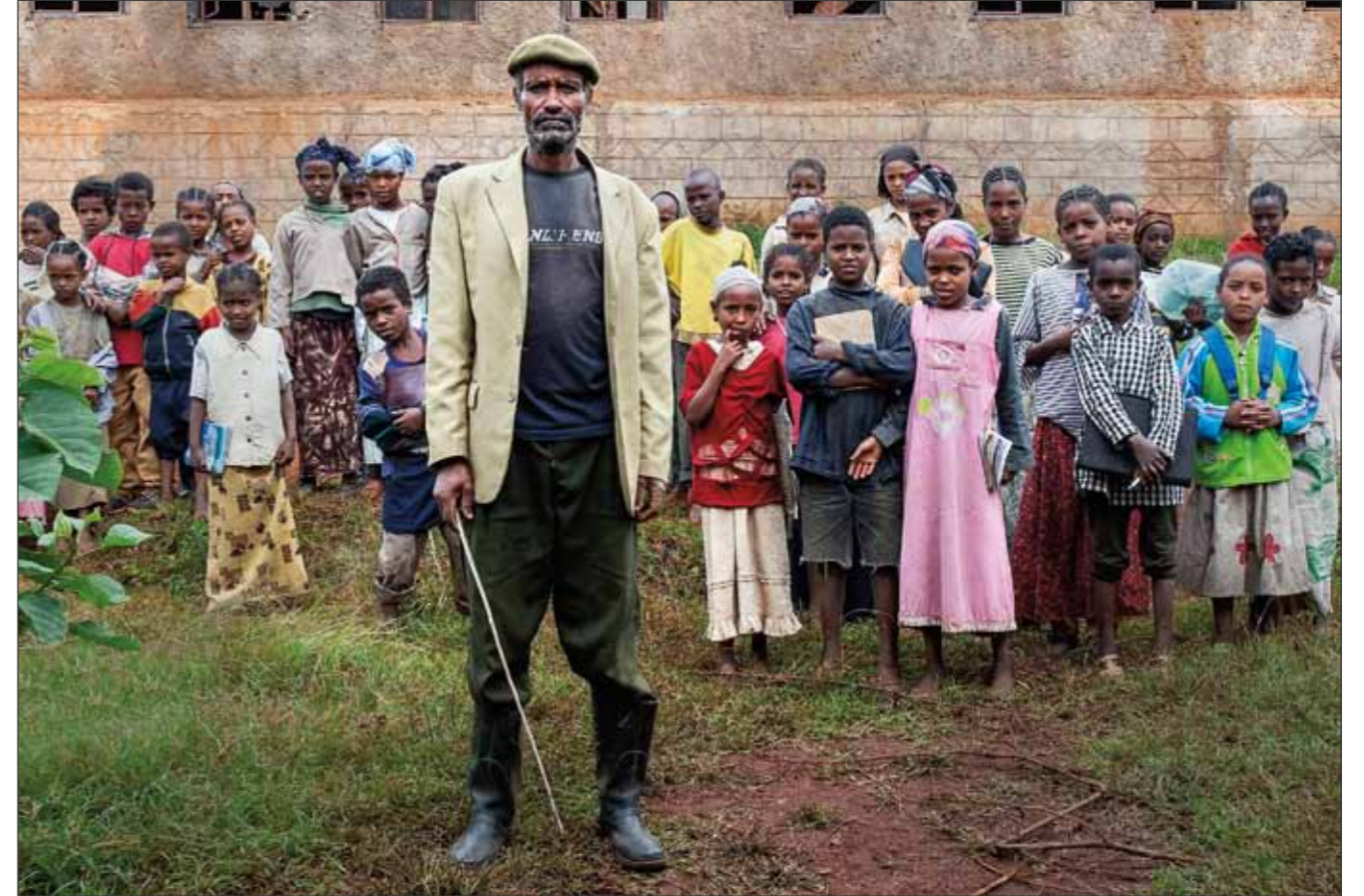
Headmaster, Ethiopia