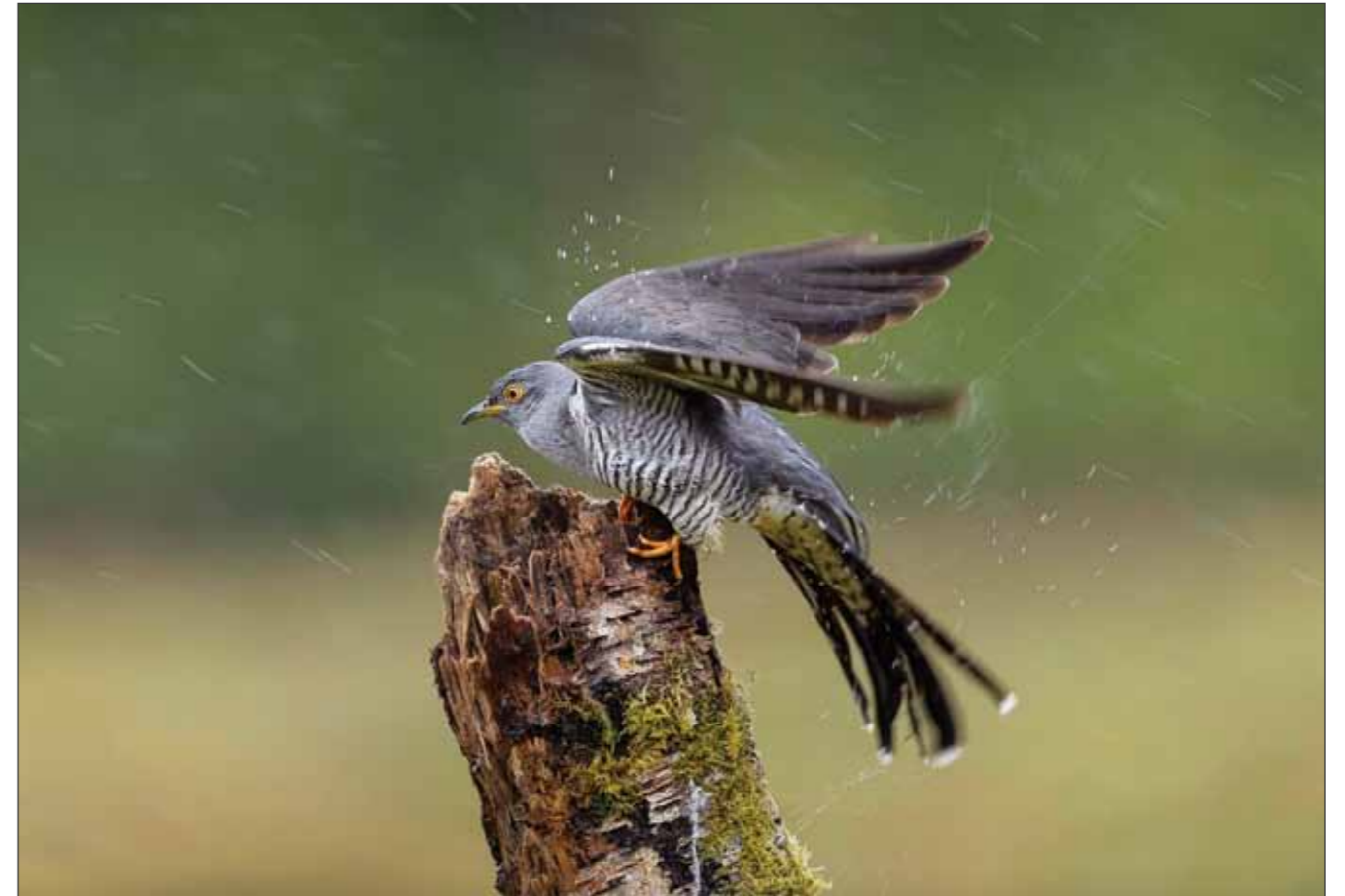
Cuckoo In The Rain by Nigel Cox