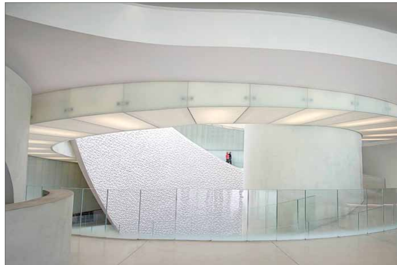
Through The Gap by Pam Sherren DPAGB EFIAP/p BPE5