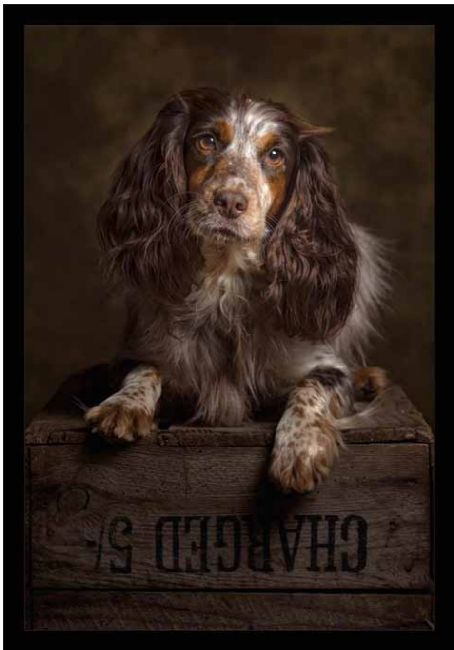
Flossie by Philippa Wheatcroft DPAGB