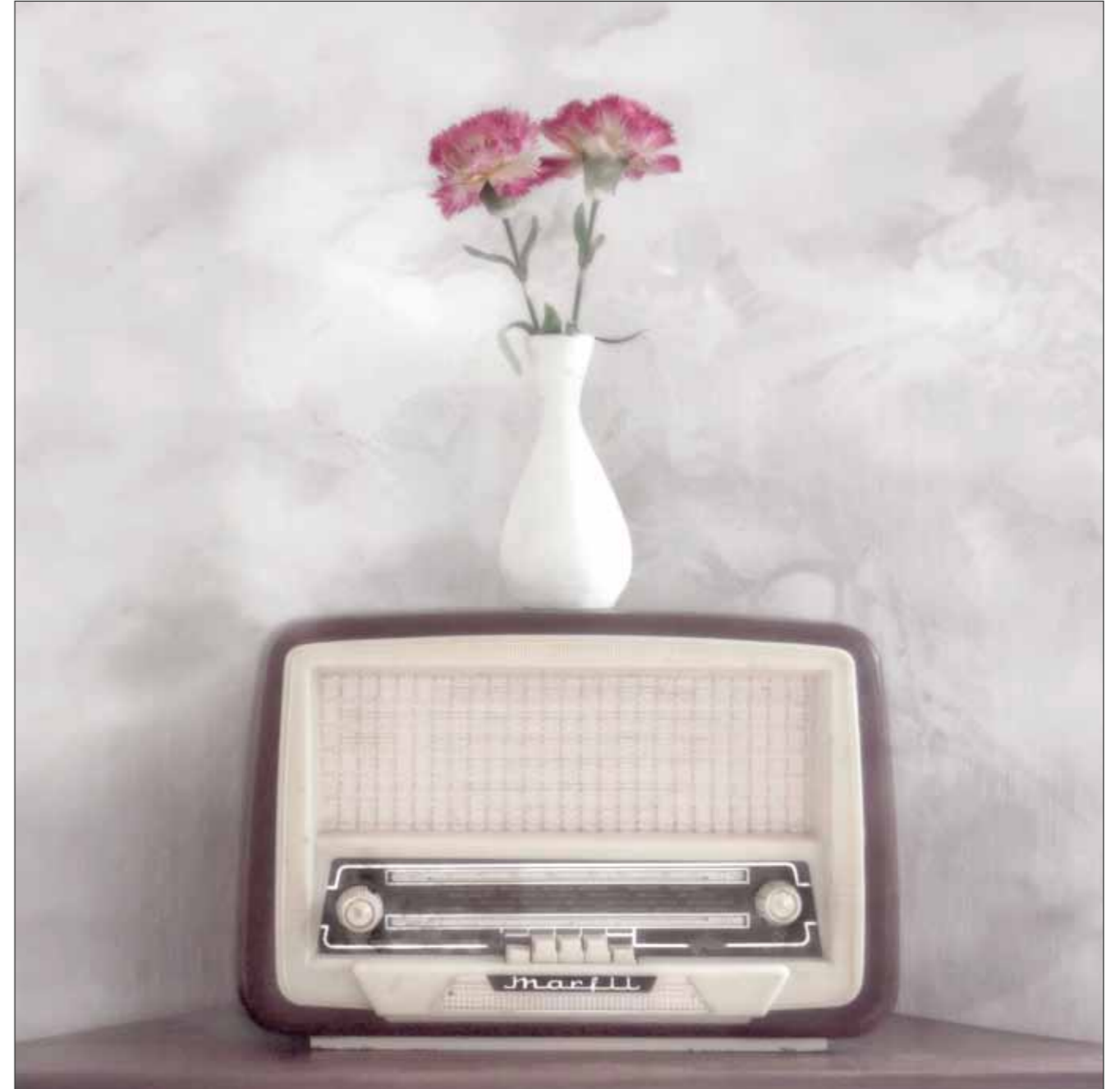
Gardeners Question Time