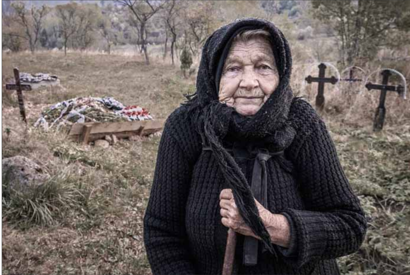
A Place Of Rest by Paul Hassell MPAGB ABPE FIPF