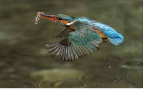
Allan Willis Overton PC "In Flight"