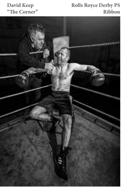
Rolls Royce Derby PS Ribbon