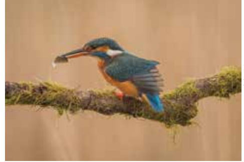
Phil Drury Ashford PS "Female Kingfisher with a Speared Fish"