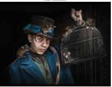
Rolls Royce Derby PS "Rat Catcher