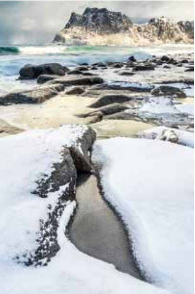
Veronica Barrett FRPS CPAGB Guildford PS "Passing Storm Lofoten Islands"