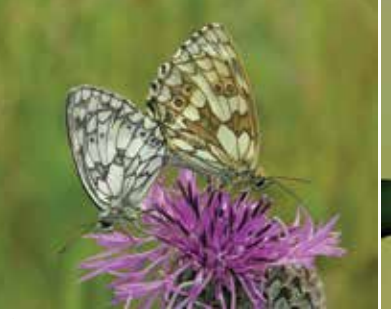
Sandra Crook LRPS EFIAP