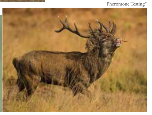
Poulton le Fylde PS