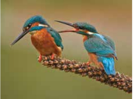
Graham Hilton LRPS BPE2 Stockport PS "Kingfishers - Male & Female"