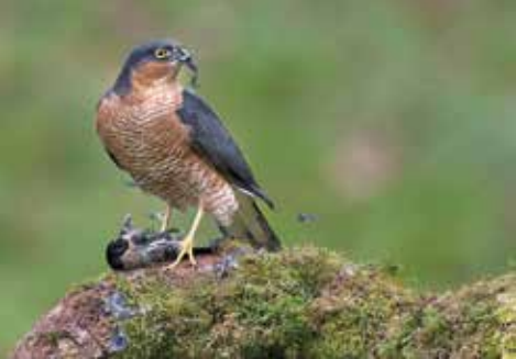
Ken Wilkie Eastwood PS "Sparrowhawk With Prey"