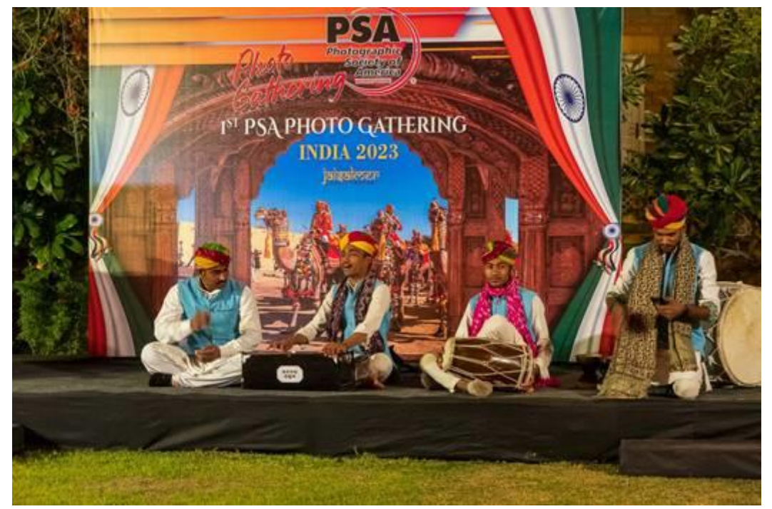
The photography started in earnest the following morning with an early start to catch the sunrise over Gadsisar Lake.