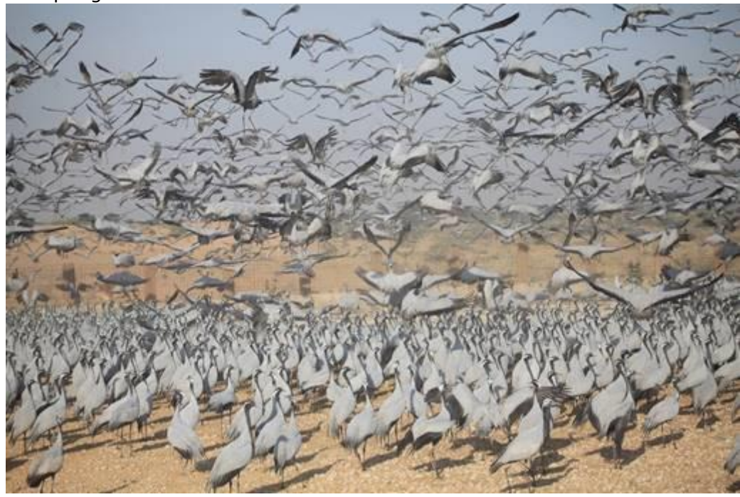
Having been to Khichan on a previous trip we organised our own trip and visited a small rural village deep in the desert. On our way we met a camel herder and a goat herder by a lake. We also tasted camel's milk.

They were very accommodating to lots of instructions from many eager photographers and enhanced the scenery somewhat. Then it was out to a village where we photographed camel herders. Like all the days it was photography, photography and more photography. The following day, Thursday, PSA had organised a trip to a village called Khichan where thousands of Demoiselle Cranes over-winter. They are fed by the local population and enjoy a warm climate before returning over the Himalayas in the spring.