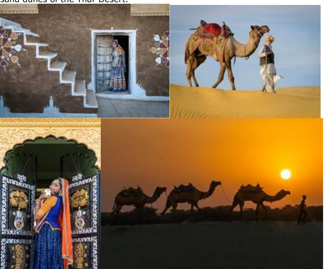
The final day allowed for free time before the valedictory function and banquet. We had another walk around the fort and visited the lake. It turned out to be a good visit where we found a very photogenic character just before our holiday ended.

Over the next two days there were outings to bustling villages, deserted villages, to Jaisalmer Fort and to Khuri where there was a photo shoot in the sand dunes of the Thar Desert.